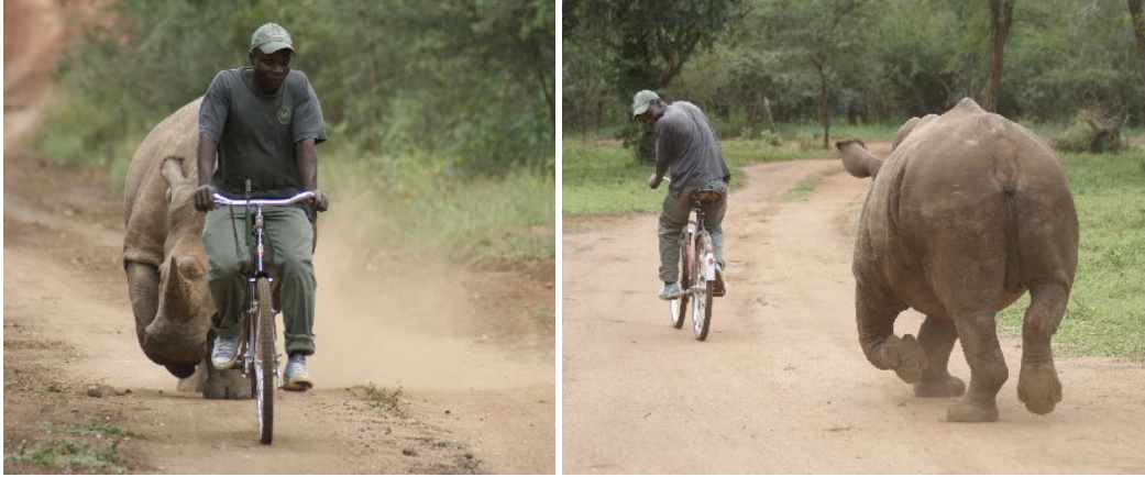
A rhino care giver on a bicycle taking his rhino out on daily exercise in the reserve.